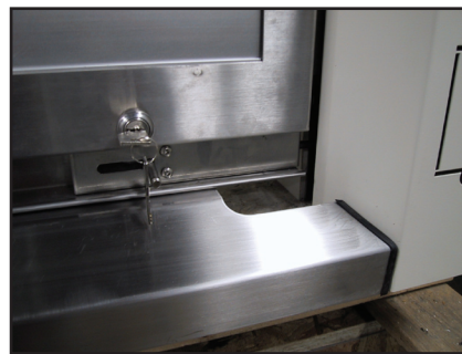
Sash lock down with key ensures that sash is not raised by unauthorized personnel.